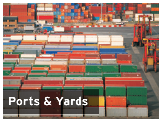
Ports & Yards